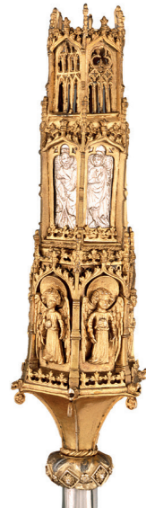
Mace of the Faculty of Canon Law