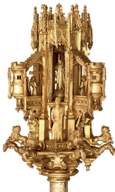
Mace of St Salvator's College

MUSA: inspiring, fascinating, for everyone!